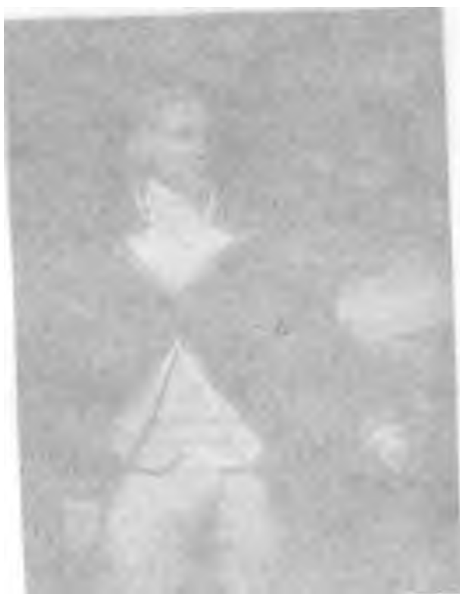
Edward Pellew, Lord Exmouth.